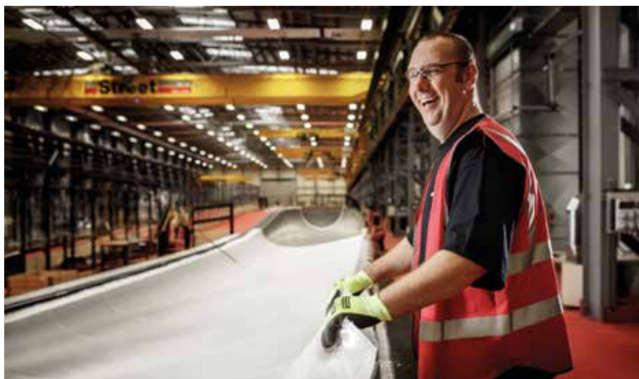
Green Port Hull/Siemens

We're highlighting four particular examples that would make use of geographical resources and existing expertise that Labour can champion. None of these could be set up overnight. However, by initially making equity investments and gradually building up expertise and capacity, they can become key players in our energy future. It took the Green Investment Bank only four years from launch to become a key player, providing £1.3 billion in patient capital that crowded in billions more. There are key lessons to learn from the GIB experience – including how to prevent privatisation in the future.